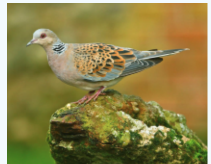
Turtle dove 15-20 territories established