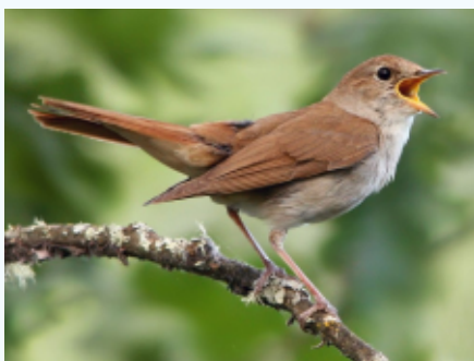
Nightingale 62 singing males spotted this year