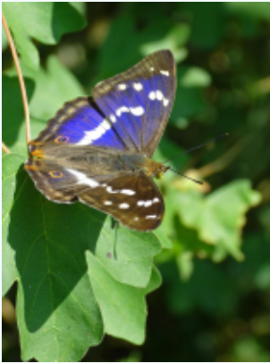
Purple Emperor butterfly 283 were seen at Knepp in one day. They swarm around trees

In 1983 Charlie Burrell took over the 3,500 acre Knepp Estate in Dial Post from his grandparents.