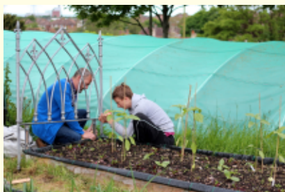
At Emmaus, they take the idea of a raised bed literally!